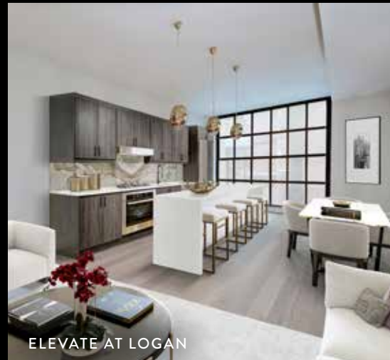
ELEVATE AT LOGAN